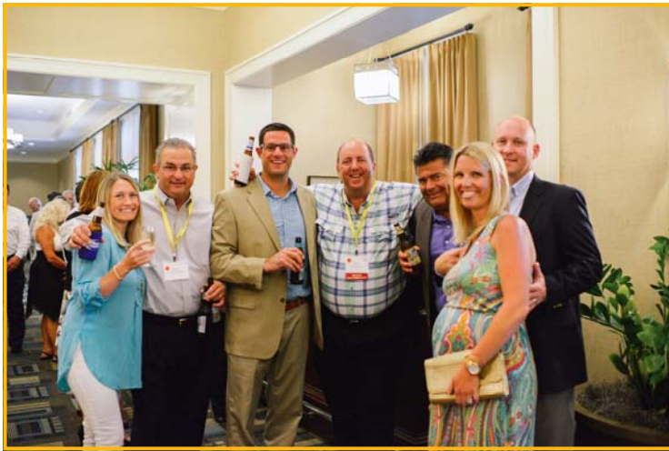
Harris Teeter leadership with The Wine Group and MillerCoors representatives.

CFIC offers complimentary child care so the adults have ample opportunity to gather with friends new and old.