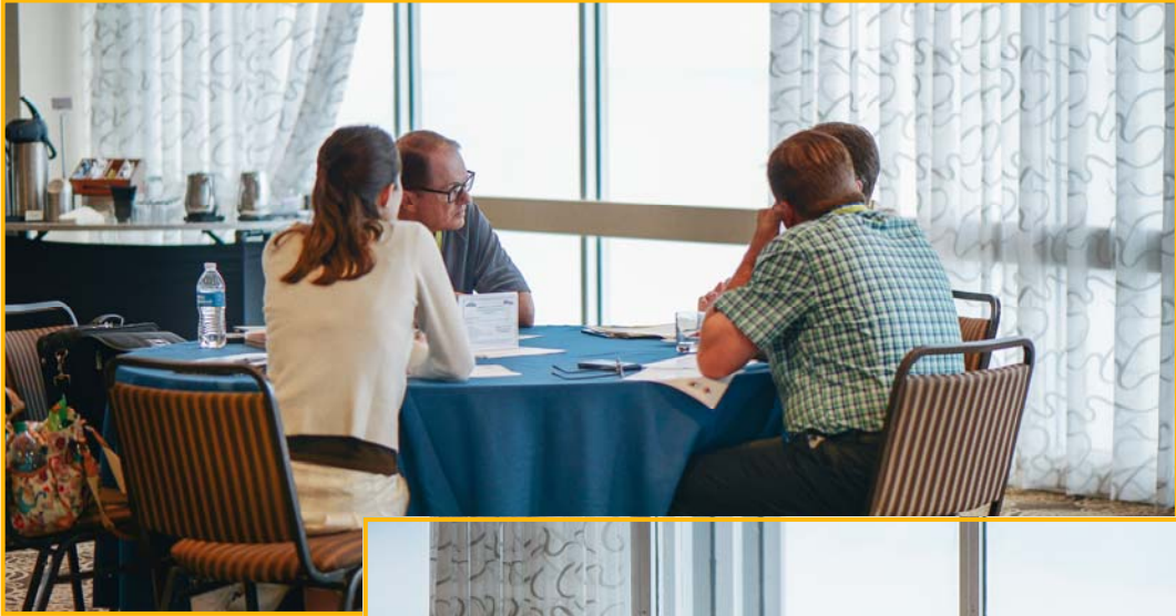
Food Lion/Delhaize America meetings.