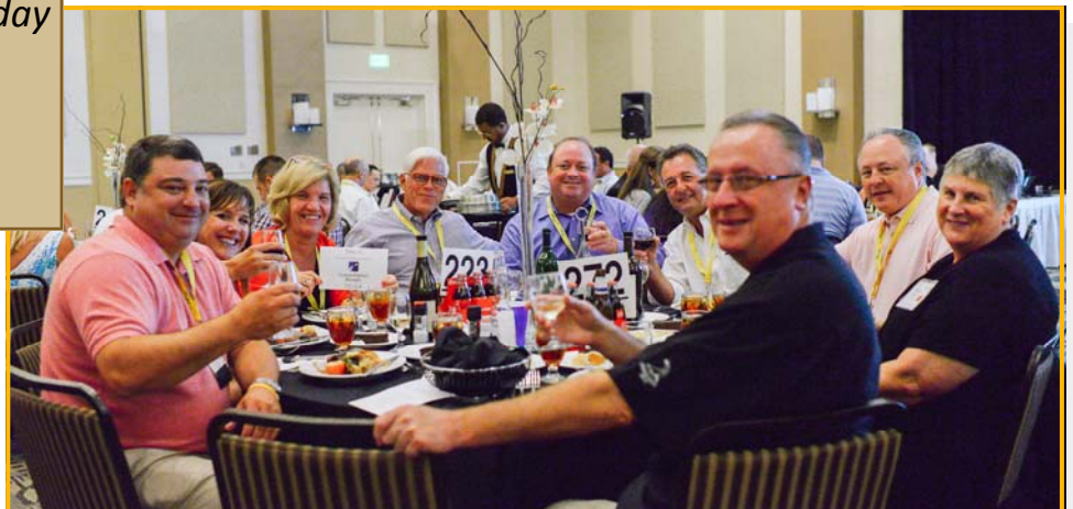
The Constellation Brands team enjoys dinner.